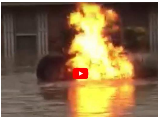
Flaming propane tank floats through the floodwater