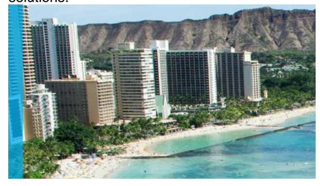
For more information click here.

The conference will also provide a forum for discussion of the issues of fire protection engineering education, professional competence, product certification and inspection, fire safety maintenance and management, verification methods and all the regulatory and administrative provisions needed to ensure that effective fire safety outcomes result from performance based design solutions.